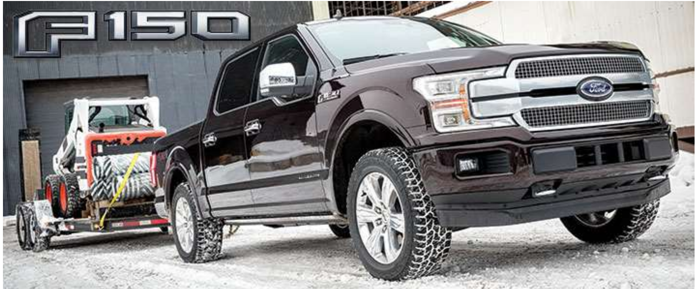
2018 F-150 PLATINUM SUPERCREW 4X4 WITH ALL-NEW 3.0L POWER STROKE ENGINE

For 2018, F-150 introduced upgraded powertrains and updated styling ... not to mention, ongoing, ever-evolving technologies. Now, the long-awaited, all-new 3.0L Power Stroke ® V6 Turbo Diesel engine is coming to our already impressive pickup! This will be the first-ever available diesel for F-150 — engineered and Built Ford Tough ® to deliver Power Stroke diesel levels of performance, endurance and capability!